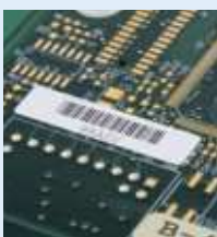
Circuit board labels