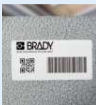
Asset tracking labels