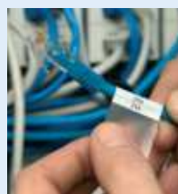
Wire marker labels & sleeves