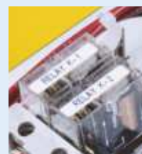
General purpose labels