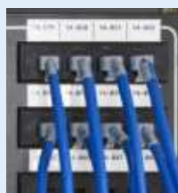
Voice & data communications