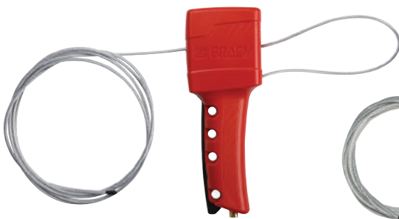
All-Purpose Cable Lockout

For those hard-to-fit, hard-to-reach or just plain hard isolation points, cable lockout devices are an easy fix. Stop the trial and error, and unnecessarily full toolbox, that comes with stocking multiple application-specific devices. With a single cable device, you can lock out several disconnects and valves. Or, for those unusual energy isolation points, cable lockouts weave, shape or wrap to provide an easy, secure fit.