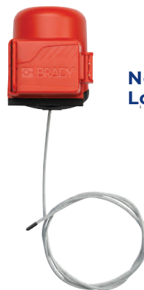
No-Handle Valve Lockout with Cable