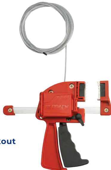
Clamping Cable Lockout