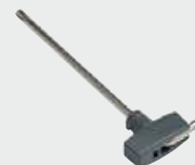
i7500 Spare T-Wrench accessory