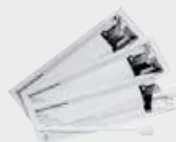
Printer Cleaning Kit, Thermal Transfer Printers