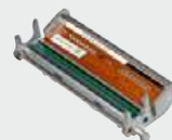
i7500 Replacement Printhead 300 dpi